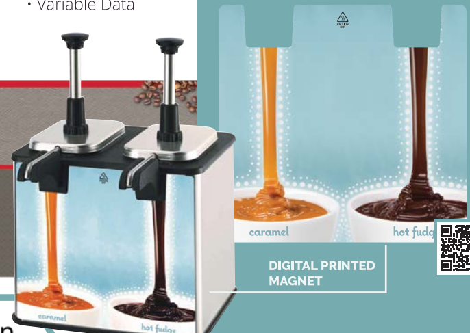
DIGITAL PRINTED MAGNET